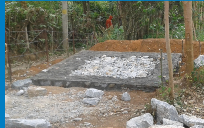
Tank construction @ Chengalar