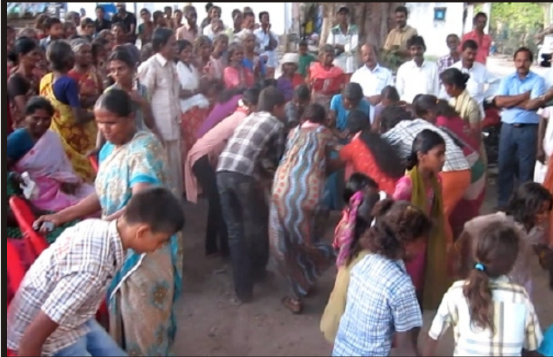
community mobilization cultural activities