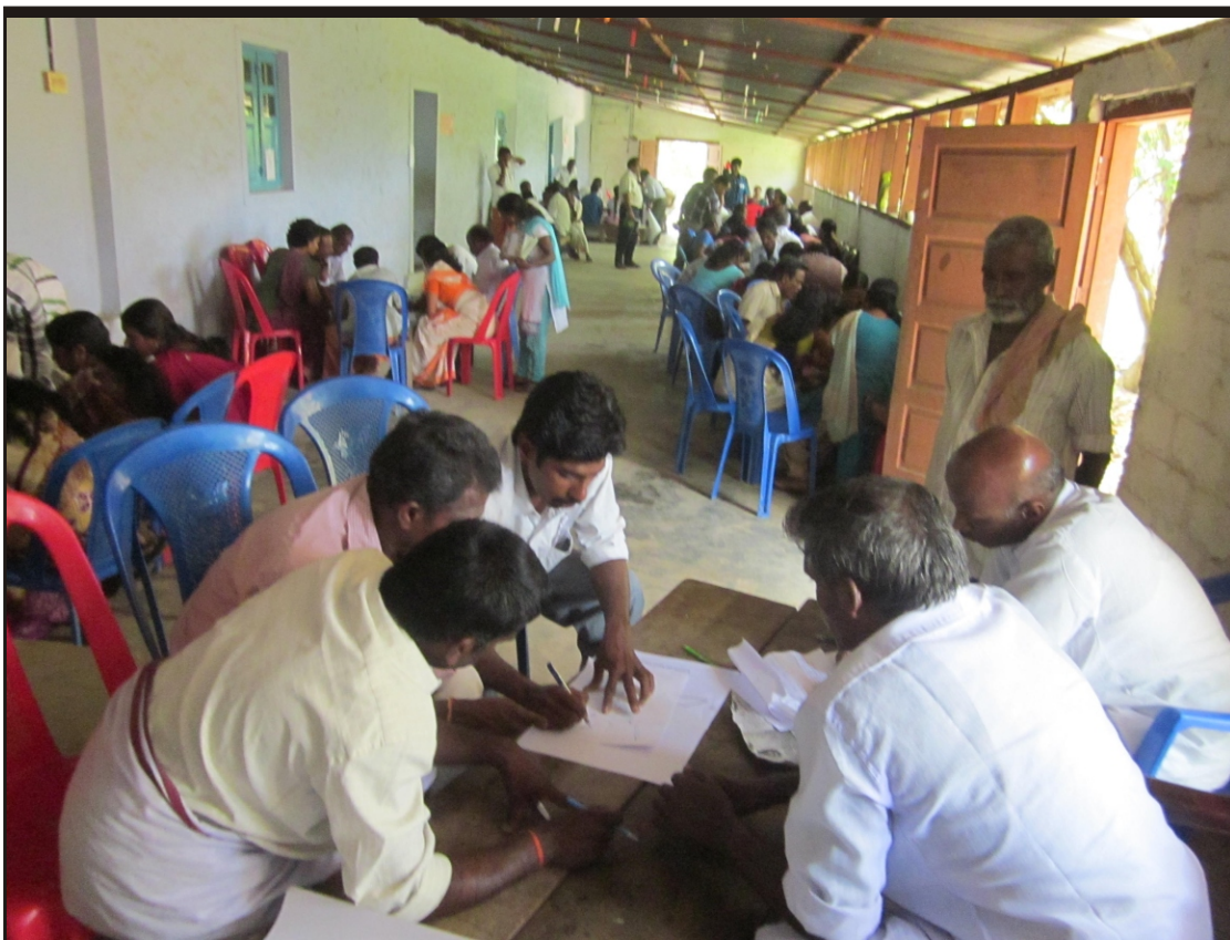
Project planning people's participation