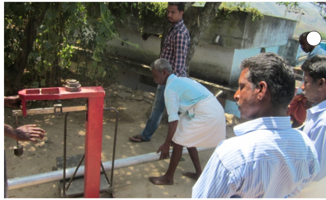
Pipe weight checking