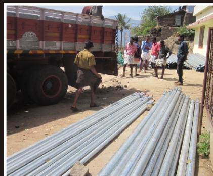
Unloading ,work contribution