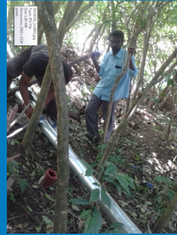
Pipe lying @ Keezhathoor